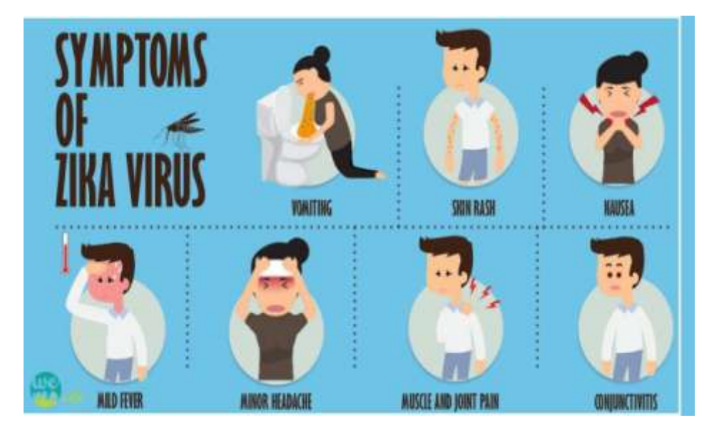
ZIKA VIRUS LABOROTORY TESTING Zika virus has been detected in whole

blood(alsoserumandplasma),urine,cerebrospinal fluid,amnioticfluid,semen,vaginalfluids and